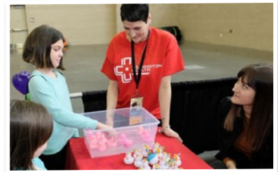
Wilmington Kidz Expo

Wilmington Health was also represented at the Wilmington Kidz Expo, Lo Tide Run, AIDS Walk, Brunswick Chamber of Business Expo, and the STEM event for Myrtle Grove Christian School!